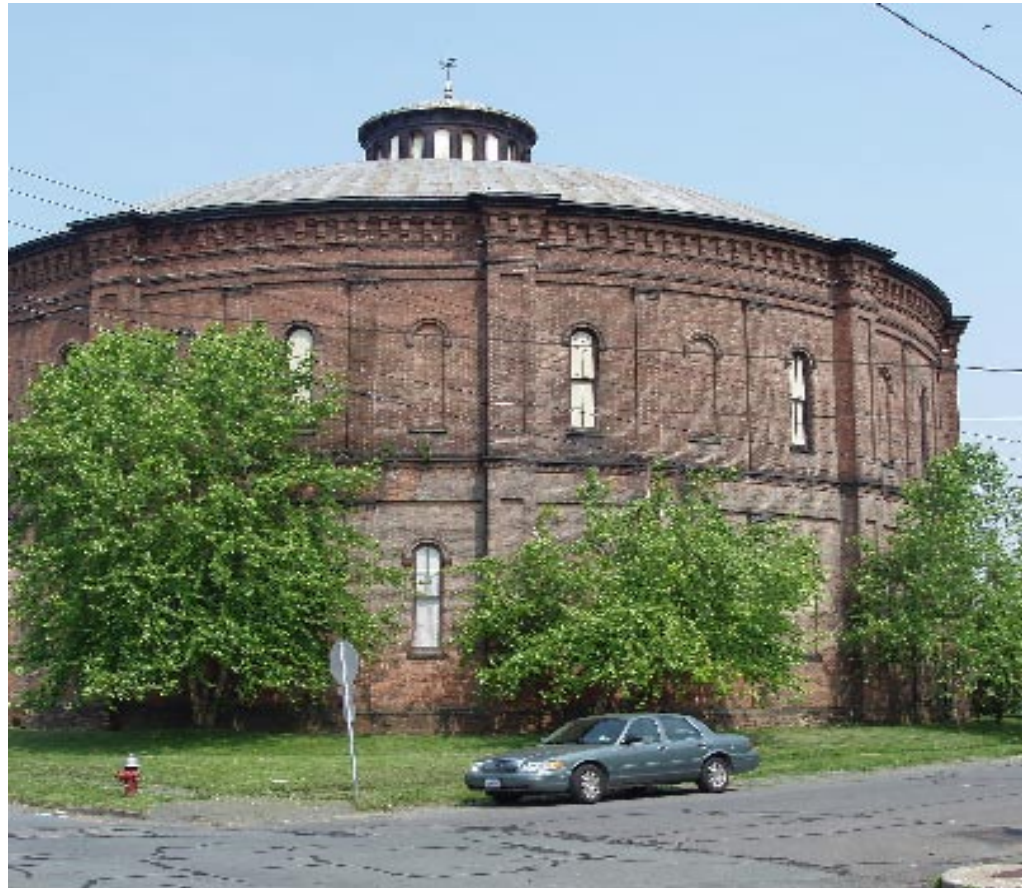
The Gasholder House, Fifth and Jefferson Streets, Troy, NY

Following the event, consider staying in the neighborhood for lunch at one of our fine local eateries – The Red Front, Flavour Café, DeFazio's Pizzeria. Then join the crowds at The RiverFest on River Street a few blocks north. Parking for our event will be available at The MarketPlace on Hill Street between Liberty and Washington (two blocks east of St. Mary's Church). The event is free but reservations are required. Please contact The Gateway by calling 274-5267.