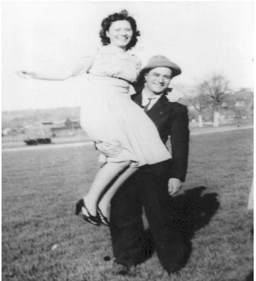
Prospect Park 1937