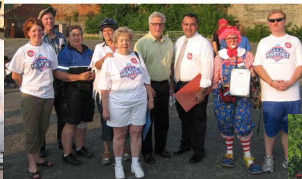
Posing for Pictures And The Walk/Bikeathon From School 12